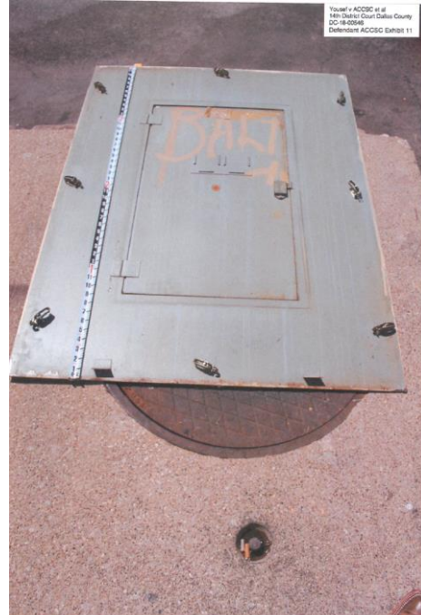
ACCSC Ex. 11 Inside of breaker panel cover detached from breaker box