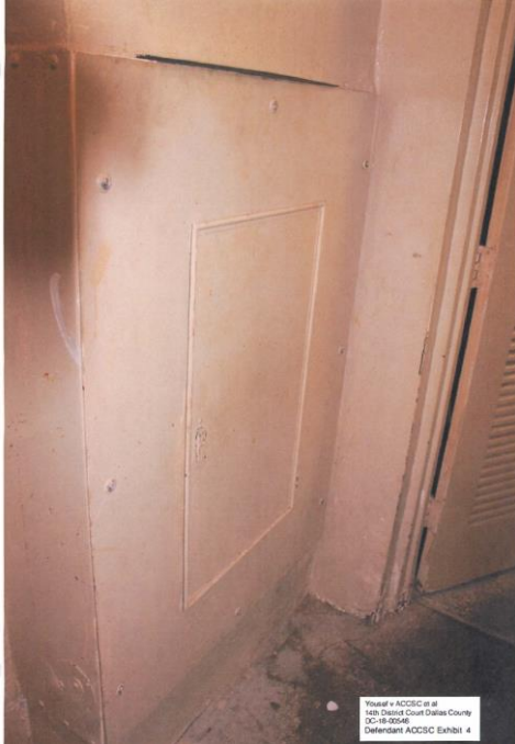
ACCSC Ex. 4 Breaker panel cover attached to breaker box